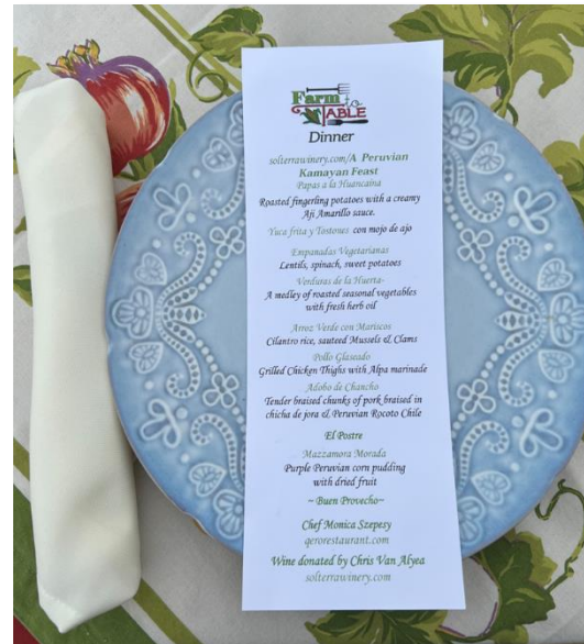
A Peruvian Kamayan Feast