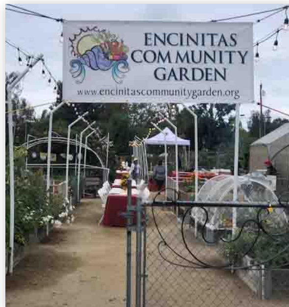
Welcome to the Event!