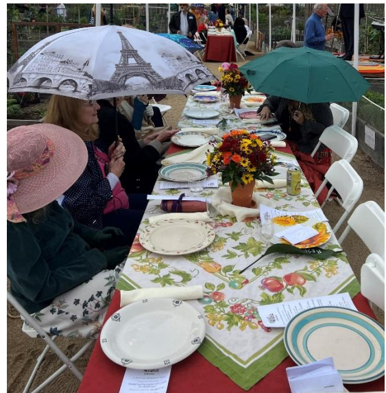
Some were prepared for a few sprinkles.