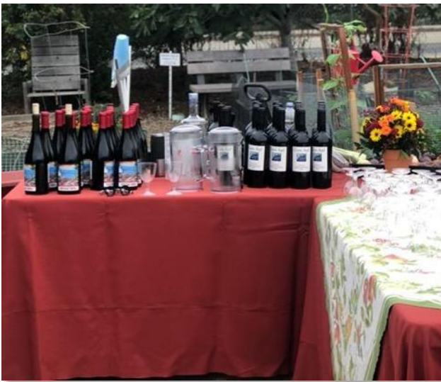
Wine donated by Solterra Winery in Leucadia.