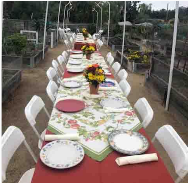
Eclectic Table Settings